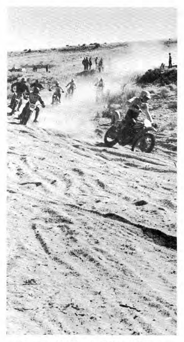
You need a high dust threshold in this sport.